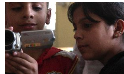
Youth in a Digital Storytelling Workshop in the Shu'fat refugee camp, Aug 2008