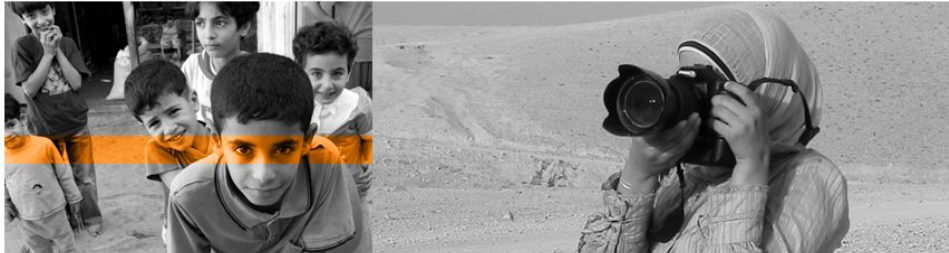
Digital Storytelling Workshops in East Jerusalem & West Bank