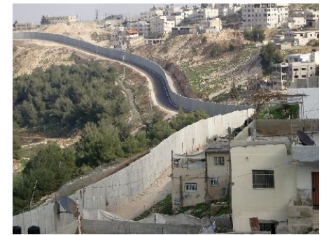
Shu'fat refugee camp, East Jerusalem

"Not too long ago, East Jerusalem was a bustling center for all Palestinians. Since the closure imposed on the West Bank and Gaza (1993), cutting East Jerusalem from its Palestinian hinterland, the city has started to gradually lose its status as an economic, educational and cultural center for Palestinians. By night, its streets are deserted and its cultural life has all but vanished. Jerusalem's Palestinian inhabitants are either seeking better opportunities elsewhere or looking for entertainment and cultural activities in other towns in Palestine or on the booming Israeli western side."